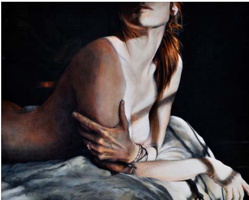
"Nude 4" Victoria Selbach